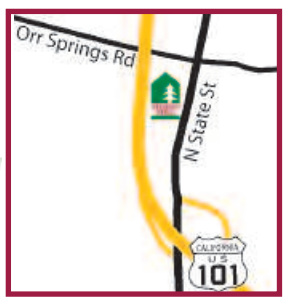
UKIAH 1870 N. State St. 462-8806